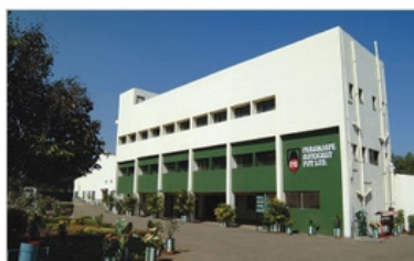
Plant 1 Satara