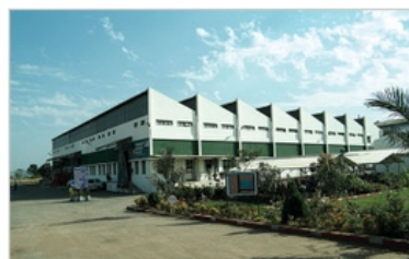
Plant 2 Satara