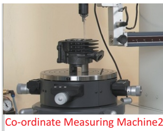
Co-ordinate Measuring Machine2