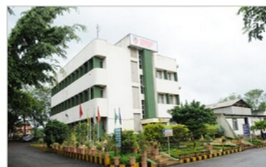
Plant 3 Shirwal