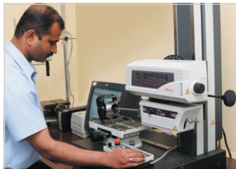
Surface Roughness Tester