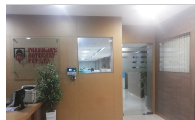
Corporate Office, Pune