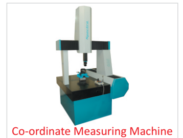
Co-ordinate Measuring Machine